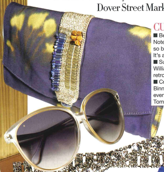
Comme des Garçons spring/summer 2008